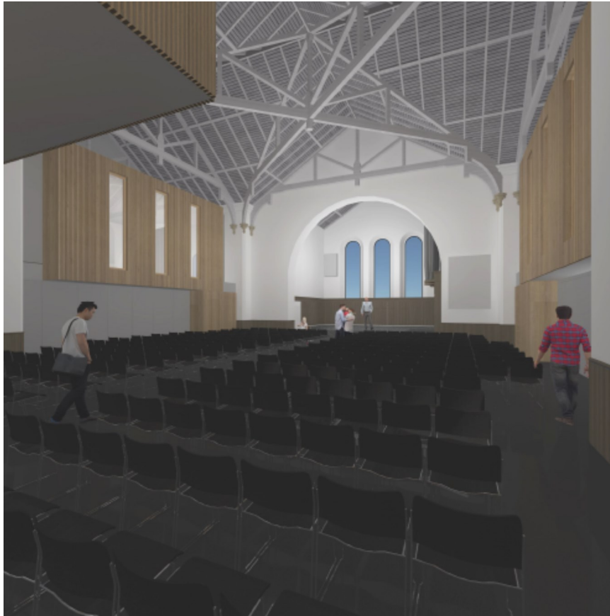
Illustration courtesy of LDN Architects

Concept illustration of auditorium post redevelopment